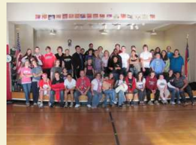
Group picture from last year.

November 18-20, some of the high school youth will be leading a DiscipleNow Weekend for the youth of the First Wesleyan Church in Hendersonville. Any high school youth interested needs to have the required paper turned in by Sunday, Oct. 9 to be considered.